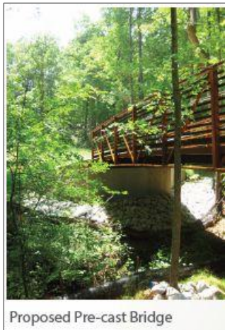
Proposed Pre-cast Bridge

There are daytime, evening, and night-of-the-event opportunities. When can you help?